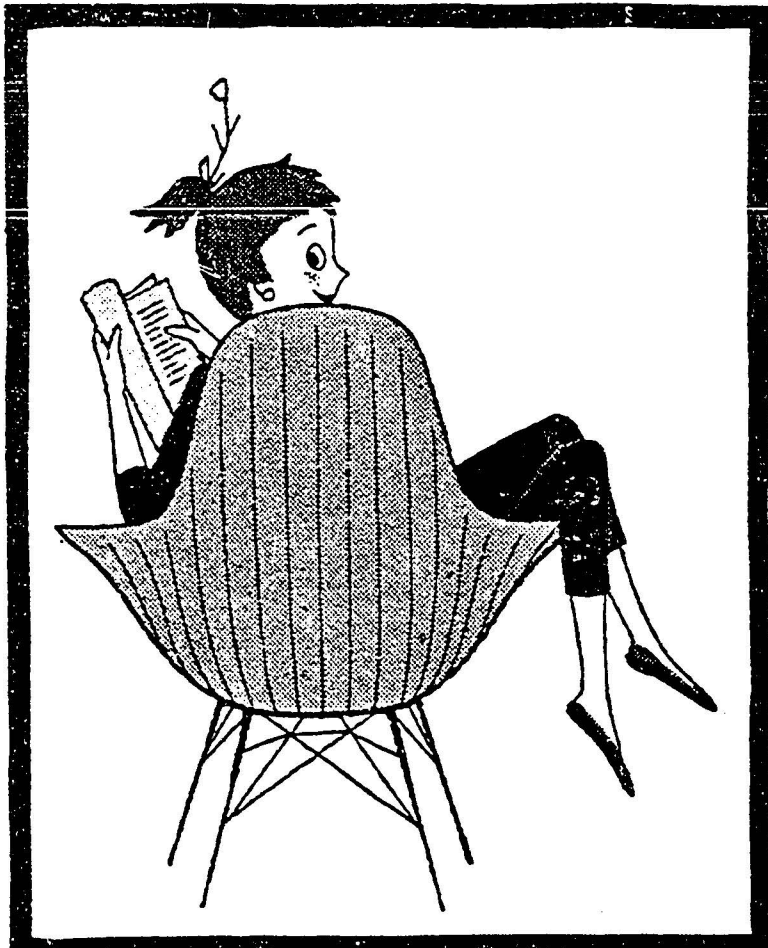
COPYRIGHT 1957 THE COCA-COLA COMPANY

Intramural softball gets underway next week.