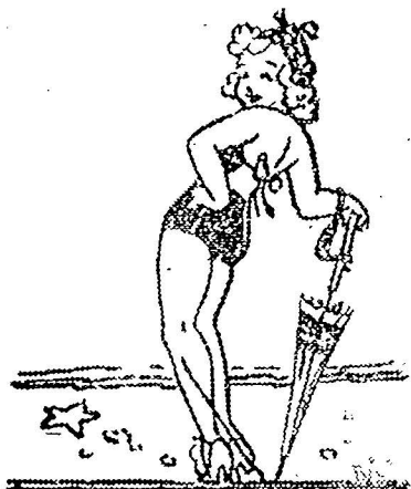
. . . prepares to plunge.